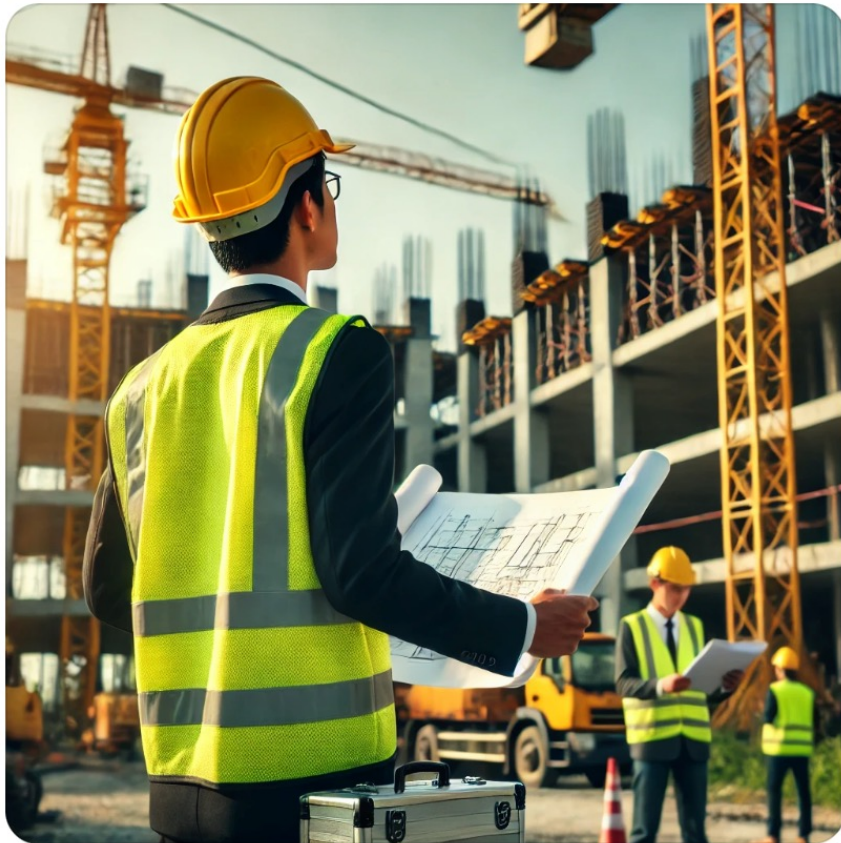
Created with DALL E

create an image of a person working in the construction sector